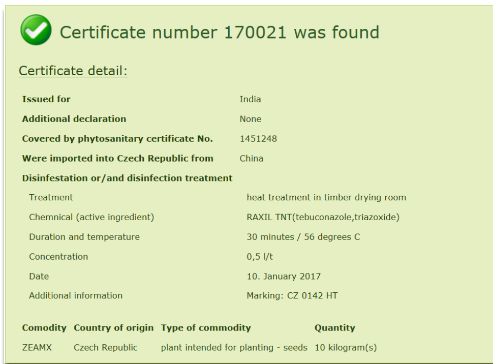
img. 2 – Validation procedure found certificate and show certificate data

Following picture shows a page on which you can see an information about found certificate. That means the entered data of phytosanitary certificate (number and date) has been found. Showed information you can compare with “printed” phytosanitary certificate which you want to validate.